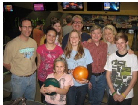
Bowlers at Flaherty's Bowl

On April 14th Living Hope Ministries held our annual bowling fundraiser. This year's event was held in three different locations throughout Minnesota. Approximately $5600 was raised. The money was allocated towards building projects.