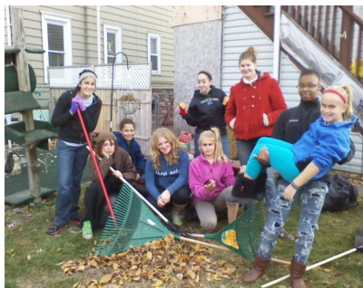
Girls Group work project