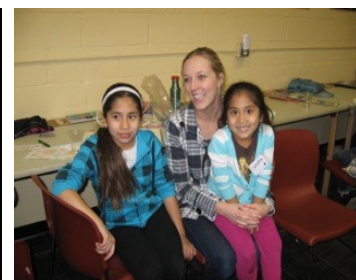
One By One Mentors and students